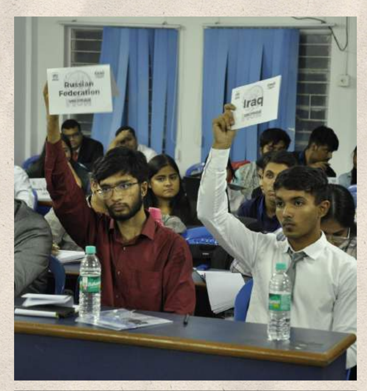
♥ IEM Management House, Kolkata

the boundaries of every individual are tested, their patience worked and their intellect challenged. IEM-MUN