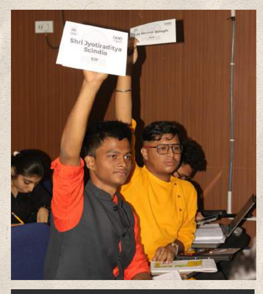
♥ IEM Management House, Kolkata

-bility, rise to the occasion and propose solutions to geopolitical issues.